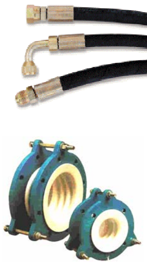
Teflon Expansion Joints

Rectangular Expansion Joints Braided Stainless Steel Hose Bellows Multi-Ply