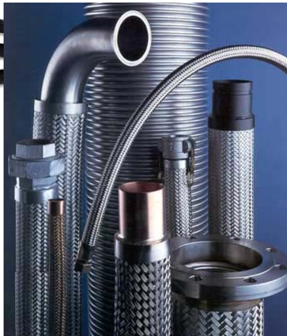
Rubber Expansion Joints